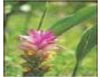
Curcuma phaeocaulis (Ezhu, Zedoary Rhizome, Gajutsu)