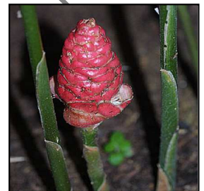
Zingiber cassumunar (Cassumunar Ginger)