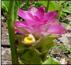
Curcuma aromatica (Wild Turmeric, Vanarishta, Jangali Haldi, Aranyaharidra)