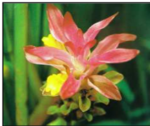
Curcuma zedoaria (White Turmeric, Zedoary Root)