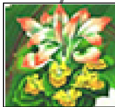
Curcuma xanthorrhiza (Temu Lawak, Ubat Jamu, Ubat Maaju)