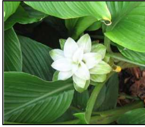
Curcuma longa (Haldi, Turmeric, Ukon, Woolgum, Kunyit, Oendre, Rame, Temu Kuning, Temu Kunyit, Goeratji, Kakoenji, Koenjet, Kondin, Tius, Kunir, Gianghuang)