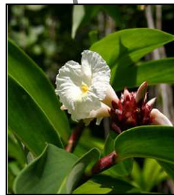
Costus speciosus (Cane Reed, Crepe Ginger, Wild Ginger, Keokand)