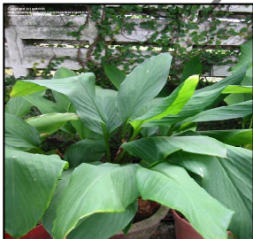
Curcuma mangga (Mango Ginger)